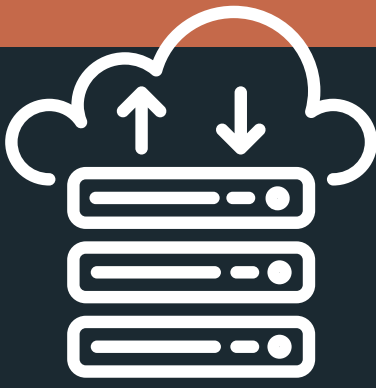
All cloud models

GOVERNMENT-WIDE PROGRAM REQUIRING SECURE CLOUD SERVICES BY PROVIDING A STANDARD, SECURITY ASSESSMENTS, AUTHORIZATION, AND CONTINUOUS MONITORING FOR CLOUD PRODUCTS AND SERVICES.